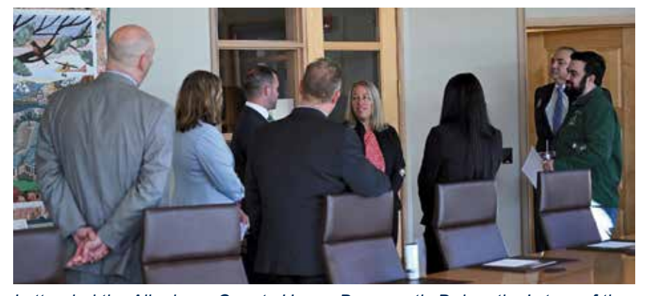
I attended the Allegheny County House Democratic Delegation's tour of the Center for Organ Recovery and Education.