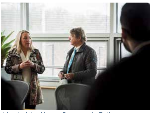
I hosted the House Democratic Policy Committee at the Phipps Conservatory and Botanical Gardens to discuss making this historic landmark a green facility.