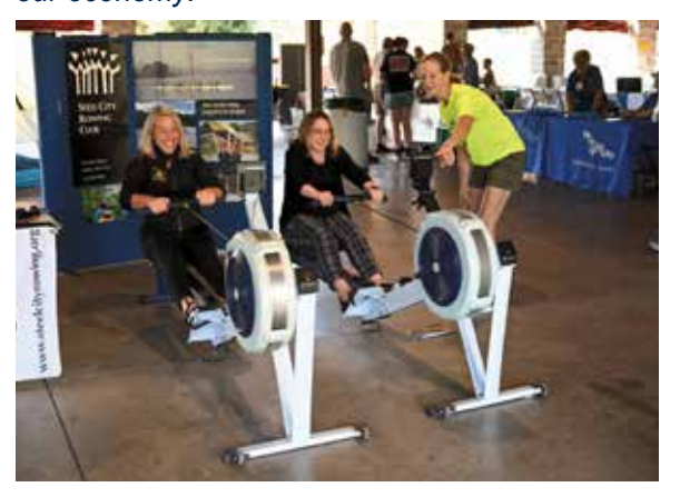
I hosted my inaugural Outdoor Recreation & Conservation Expo. We had vendors and exhibitors who provided information on local and state resources available to anyone who hunts, fishes or is an outdoor enthusiast.