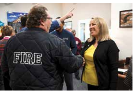
I hosted an open house at my district office, located at 1296 Pittsburgh Street in Cheswick. Should you need assistance, visit my district office and my staff will assist you!