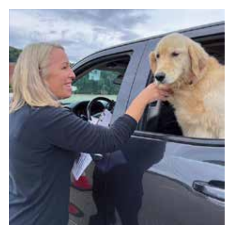
I partnered with the Allegheny Valley Regional Police Department to help residents replace illegible license plates - and met some furry friends, as well.

I partnered with Seniors for Safe Driving to host two classes. Thanks to this partnership, seniors also secured discounts on their automobile insurance after attending the class.