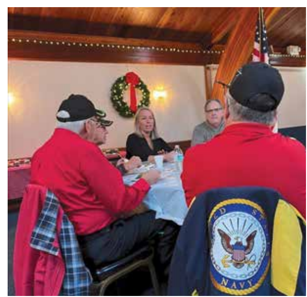
I hosted my first holiday luncheon to recognize veterans from the 33rd Legislative District. We thanked more than 60 veterans for their service to our country!