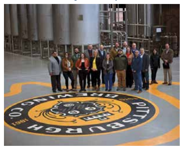
I hosted a tour of the Pittsburgh Brewing Company where we discussed investments in our economy!