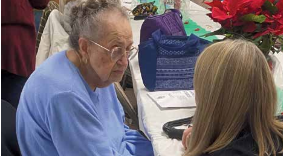
I hosted a luncheon where we provided information on services available to seniors, such as Pittsburgh Regional Transit's Senior ConnectCard, the Property Tax/Rent Rebate Program, Medicare, and more. Thank you to UPMC – St. Margaret and the Allegheny County Sheriff's Department for providing services, including bone-density screenings and taking back prescription medications.